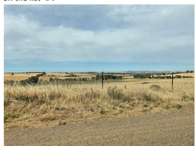
Coolamon was our next stop, again found shopping on the list .

Members found different venues to enjoy lunch, the Chinese at the Sports club was our lunch choice. The road travelled home was at your own time and direction. Ganmain made it a nice round trip for our day out.